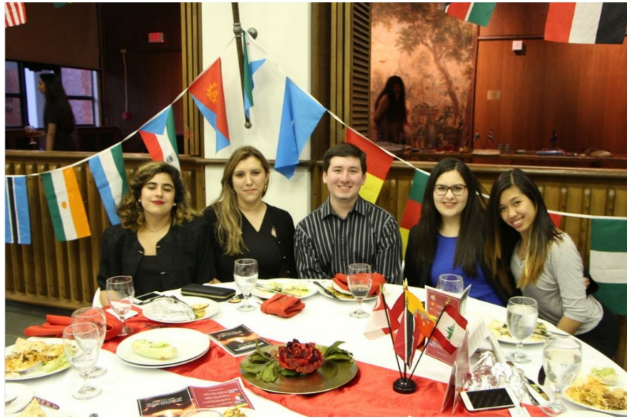
Banquet in the past